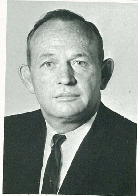
J. L. DODD ELEMENTARY PRINCIPAL

PRESTIGE COMES THROUGH INDIVIDUAL MERIT. THE WINK SCHOOLS HAVE A GREAT DEAL OF PRESTIGE WHICH IS WELL DESERVED BECAUSE OF THE FINE EDUCATIONAL OPPORTUNITIES OFFERED AND THE LONG HISTORY OF QUALITY EDUCATION. YOUNG PEOPLE SHOULD MAKE THE BEST OF THESE OPPORTUNITIES TO MEET THE DEMANDS THAT YOUTH BE BETTER PREPARED TO FILL THEIR PLACE IN SOCIETY. TO ACCOMPLISH THIS, STUDENTS MUST HAVE A SERIOUS SCHOLASTIC OBJECTIVE - A BURNING DESIRE TO WORK HARD TO LEARN.